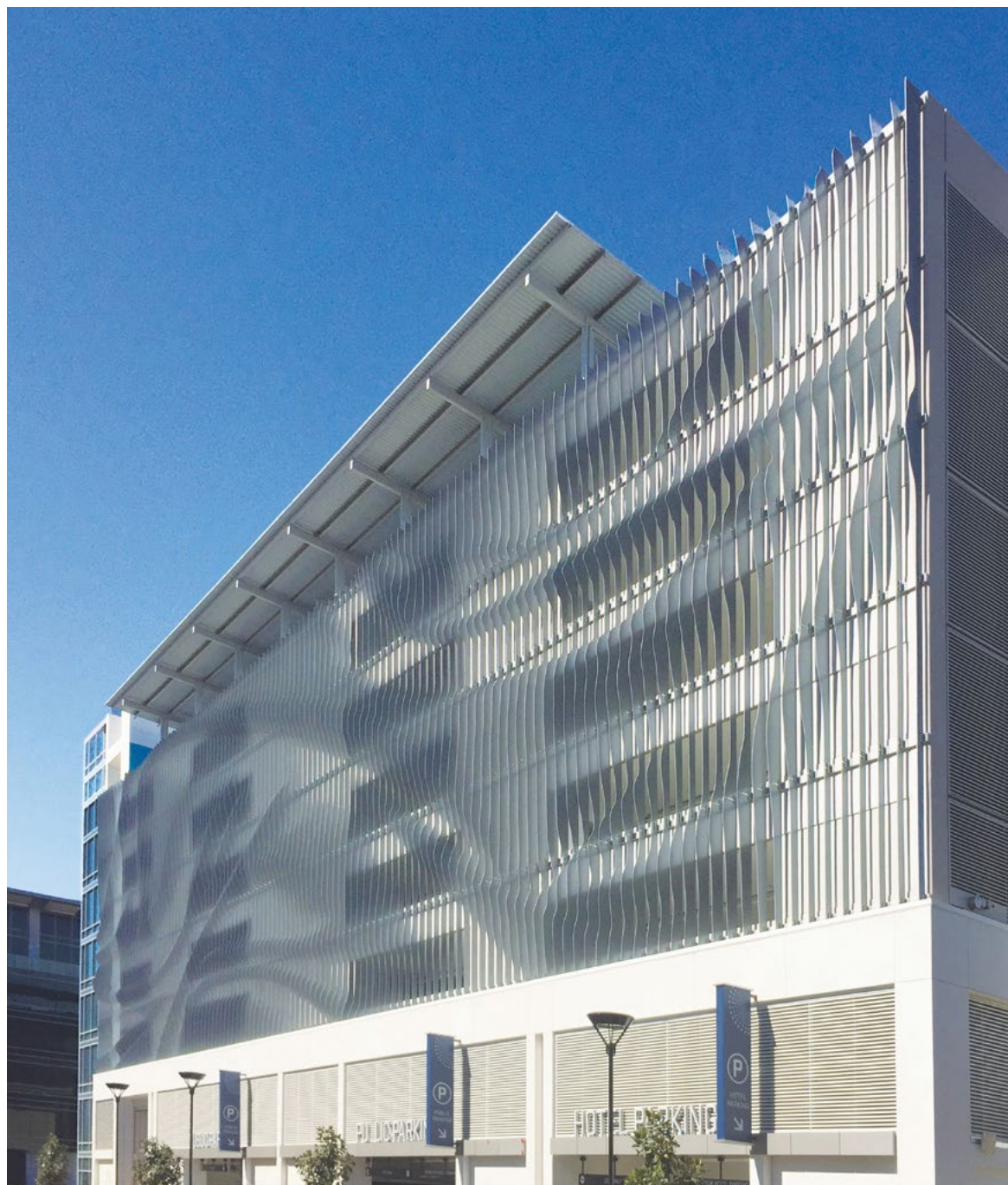
San Antonio car park, California – Levlux

Alumasc's strategy is to build specialised positions in premium building product markets that are capable of growing faster than the UK construction market.