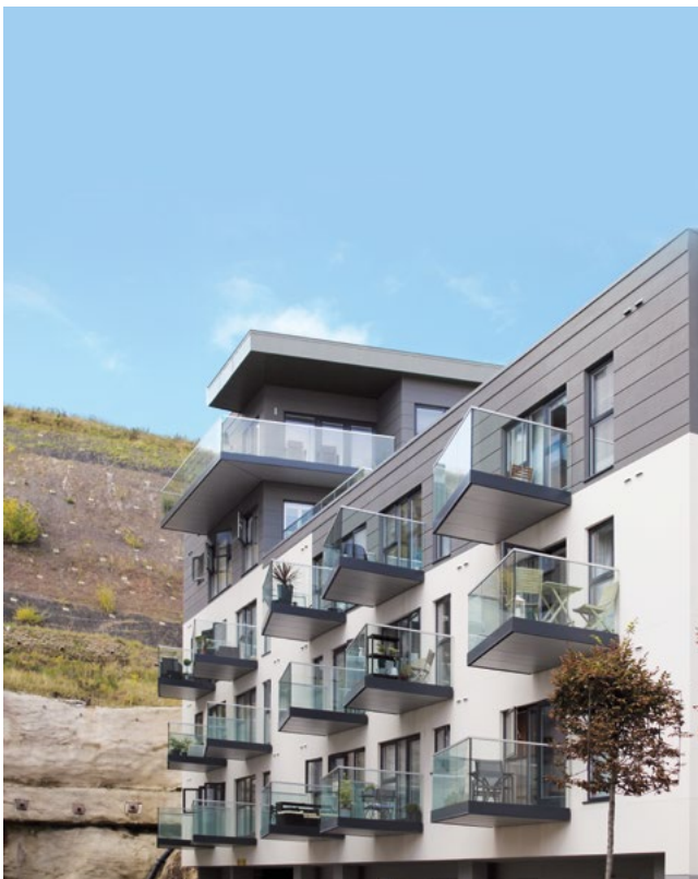
Westmount Dandara, Jersey – Levlux Balconies